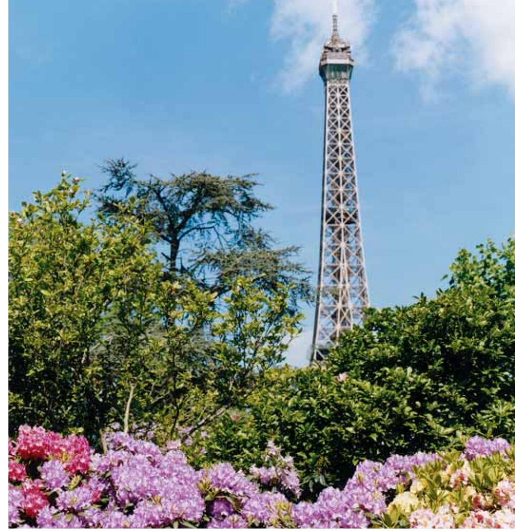
The Eiffel Tower is twice as tall as the Washington Monument but weighs 700,000 tons less!

Learn before you go www.eftours.com/pbsfrance www.eftours.com/pbsuk